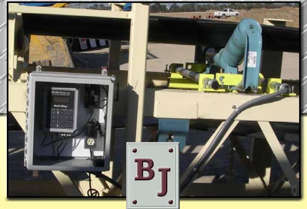
BUTLER - JUSTICE Inc.

Not with us. We give you the full 4-course “dinner” of sales, installation, calibration and service. This policy has worked for over 20 years and over 1,000 installations. We know that you don't have time to make a bunch of phone calls. Just make one call to us!